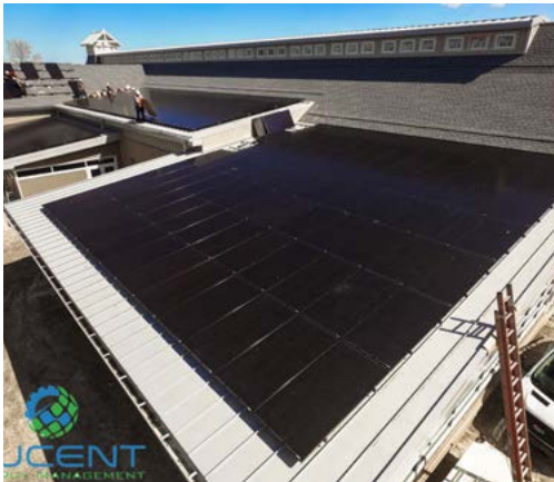
Solar panels on Lewes Library.

The Energize Delaware Revolving Loan Fund has a track record of providing low-interest loans for businesses, non-profits, school districts and local governments to reduce their energy bills by improving the efficiency of their operations. 2016 was another strong year, closing 6 loans totaling $6,363,994.