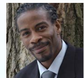
Nnamdi Chukwuocha Wilmington City Councilman