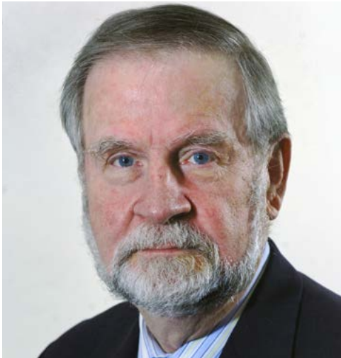
State Senator Harris B. McDowell III